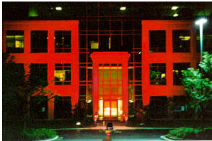
LIGHT OUTPUT CHART

The DSN 150 PRO™ is brought to market in a ground breaking, highly competitive price enabling the use of multiple luminaries without burning a hole in your pocket.