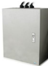
Wiring of the power supply case